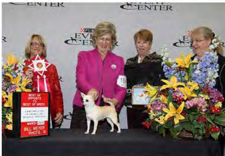
Gch. Kokura Yama JP Darling Dartan