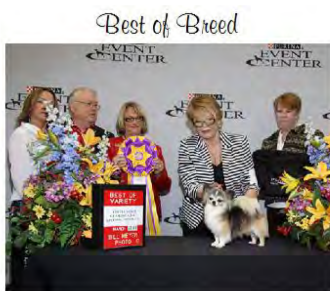
Ch. Taradonna Flash Harry (England)