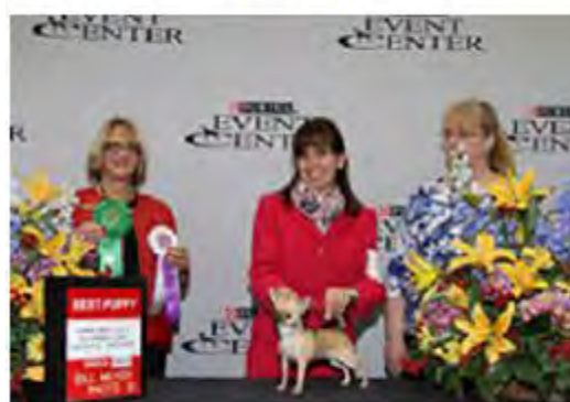
TEGS Leather and Lace