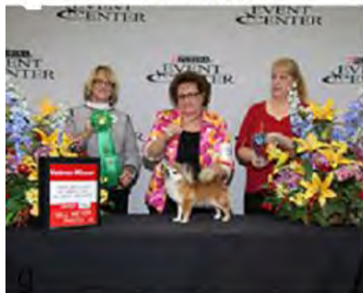
GCh. Dartan Star Queen of Ayrwen