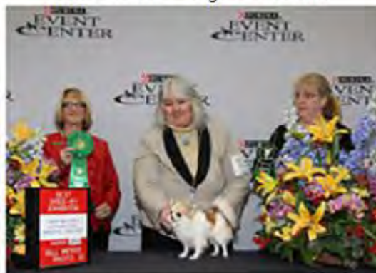
Grace Acre Almost Persuaded