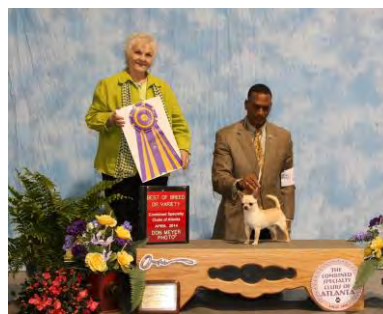
Best of Breed