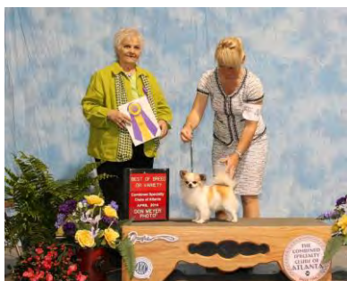
Best of Opposite Sex to Best of Breed