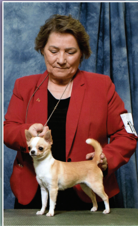
CHULA'S CHASING RAINBOWS

GCH CH Chula's Light Em Up-L ROM x GCH CH Triple A Kissy At Chula's ROM