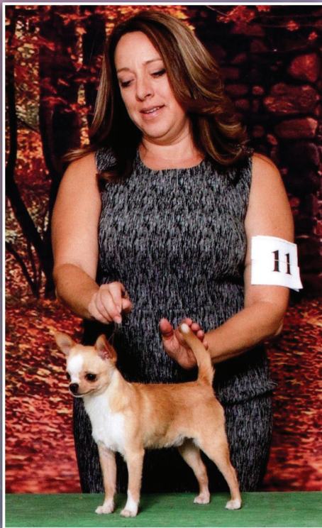
CHULA'S GET LUCKY